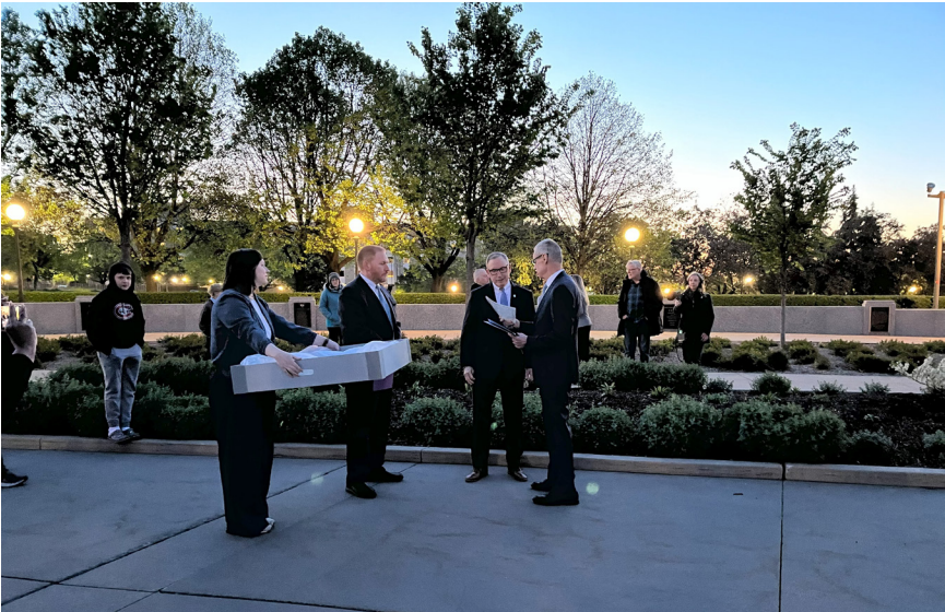
May 11, 2024 The final historic flag to fly over the Minnesota Capitol Building was presented to the Minnesota Historical Society for preservation.