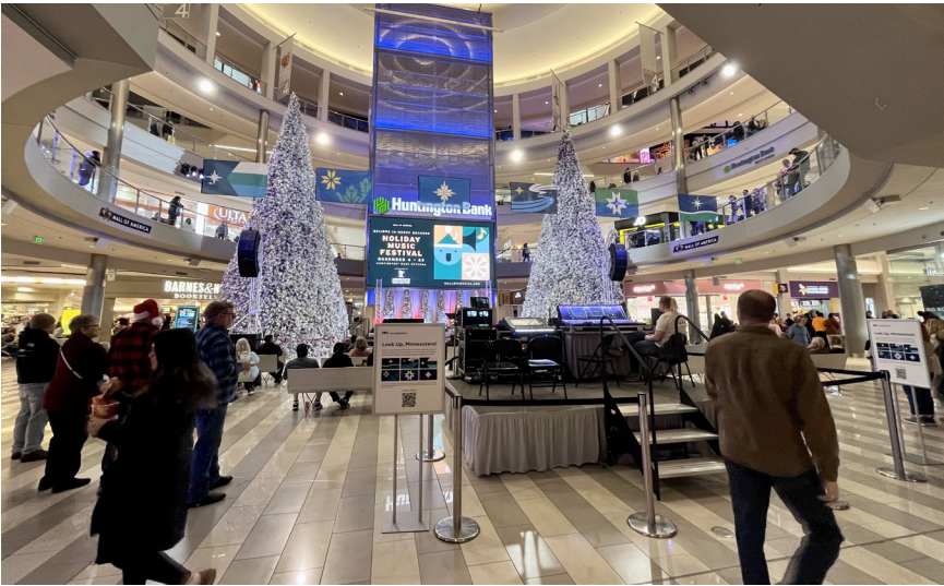
December 10, 2023 State flag finalists are displayed at the Mall of America.