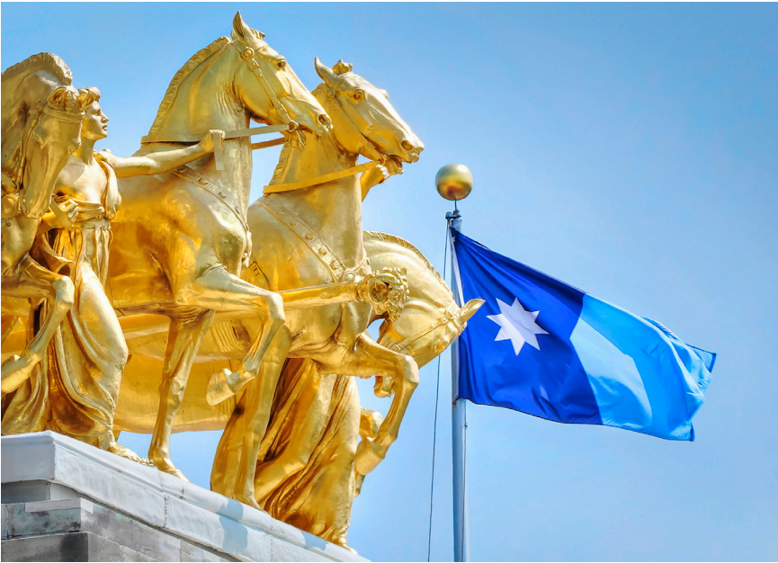
May 13, 2024 The Minnesota State Flag flies above the Minnesota Capitol Building.