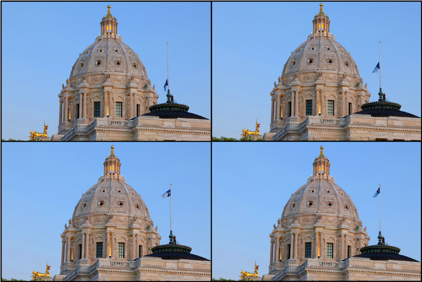
May 11, 2024 The incoming Minnesota State Flag rising above the Minnesota Capitol Building for the first time.