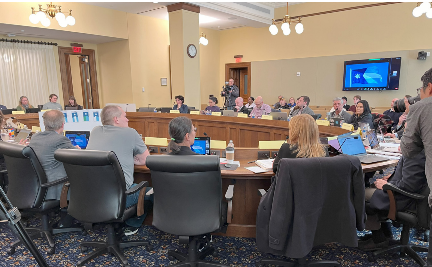
December 19, 2023 The State Emblems Redesign Commission adopted the final design for the new state flag.