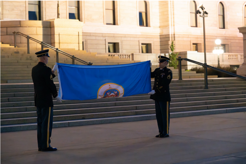
May 11, 2024 The Minnesota National Guard Color Guard folded and preserved the outgoing state flag at a sunrise ceremony.